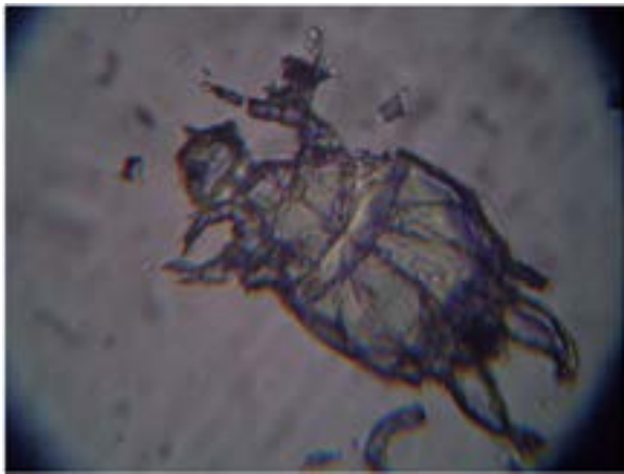
Dust mite carcass shown at 400X magnification

Every year we complete multiple air quality projects to identify why occupants experience adverse health reactions in their finished