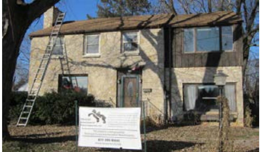
One of two WAHI education houses at the 2013 Fall Seminar.

I am pleased to report that WAHI made it into the Milwaukee Journal Sentinel Business Section on Friday, December 6. For the past 4-5 years I have contacted the local newspaper in the area of every seminar we have had. The intent was to see if they would be interested in running an article about Wisconsin home inspectors and the educational programs put on by WAHI. My efforts often fell on deaf ears – until this year!