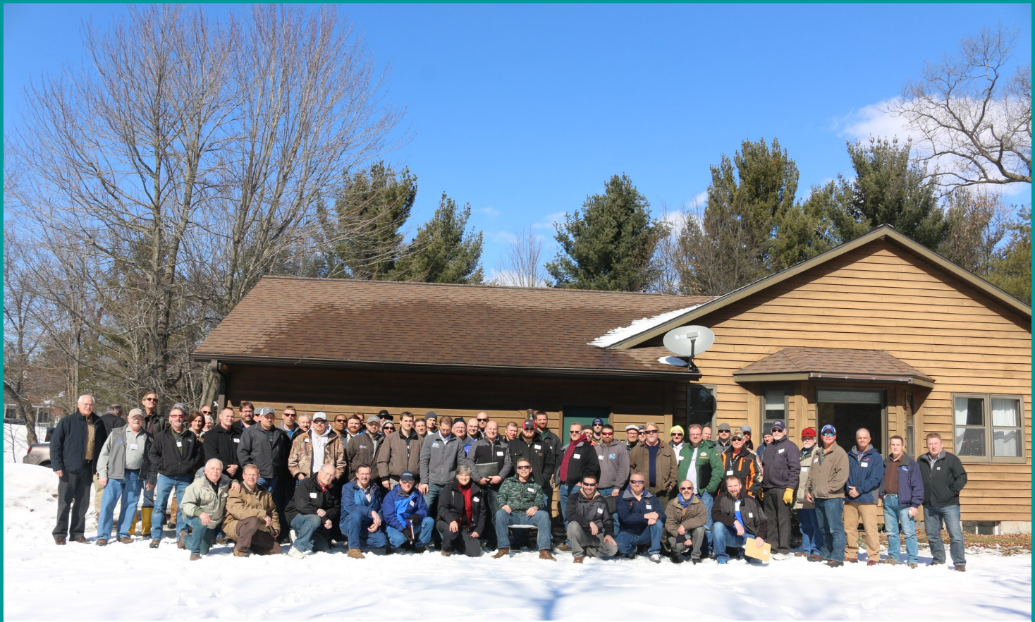
The gang's all here! Spring '18 WAHI Education House Attendees